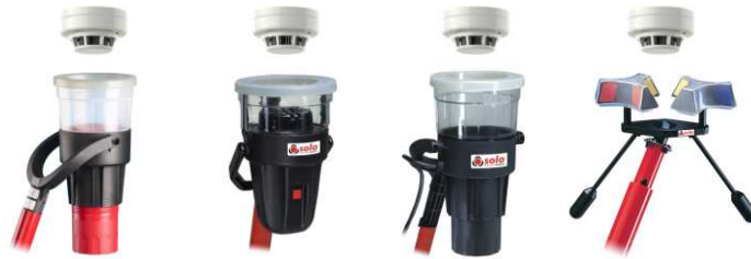
Solo 330 Aerosol Dispenser