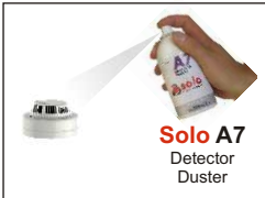
Solo A7 Detector Duster