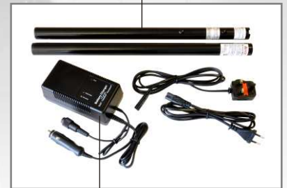
Solo 725 Fast Charger