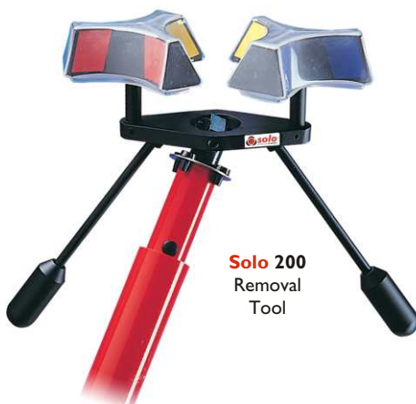
Solo 200 Removal Tool