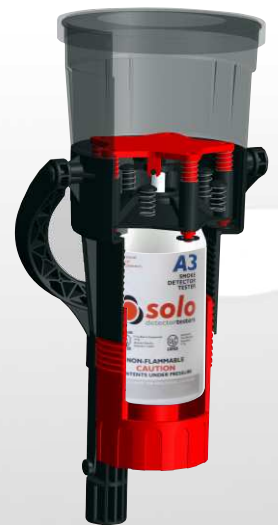
Solo 330 for use with Solo A3 & C3 Aerosols

Solo 332 is available for larger diameter detectors.